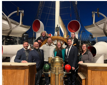
Seattle Delegation in Bergen, Norway on the Statsraad Lehmkuhl for One Ocean Week