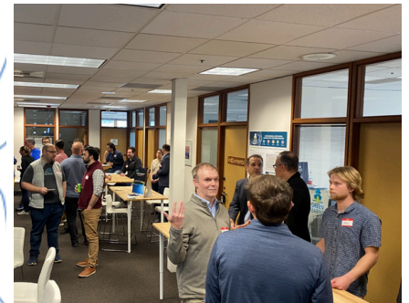
Meet & Greet at the Blue Hub with founders and members.