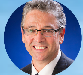
Comm. Fred Felleman Port of Seattle