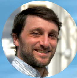
Cosmo King IO Currents