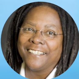
BG Nabors-Glass Seattle Goodwill