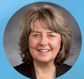
Rep. Gael Tarleton WA State Legislature