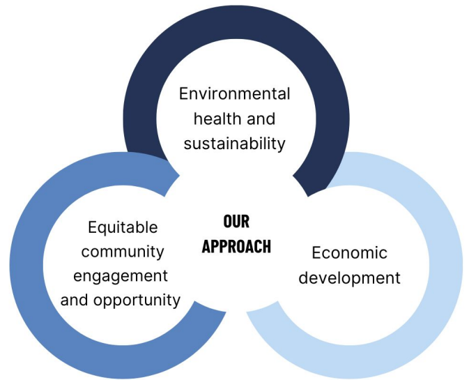
The triple-bottom-line lens of Maritime Blue’s approach